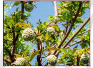
Custard Apple Tree